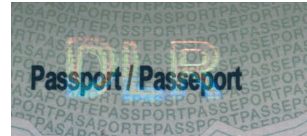
floating 2D/3D image